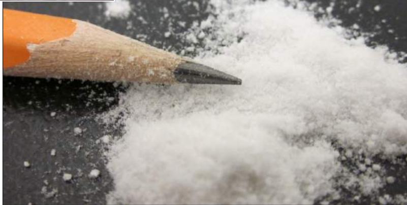
A filter aid is a finely graded material which, when added to the liquid to be filtered, collects on the septum (a screen or cloth). The filter aid forms a porous layer on the septum and thus the filter aid is the filtering medium that traps the solids being removed and prevents them from blinding the septum.

aid particles to produce optimum flow rates and clarification abilities for a wide variety of applications.